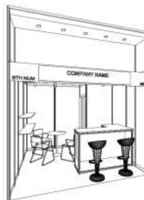
Option 設計 (B)